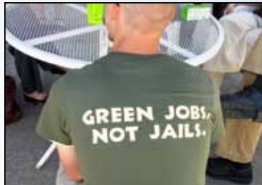
A Riverfront Farms intern.

Worksite interns and leaders spoke at each location, giving those on the tour a more personal view and narrative of what SYEP meant to them and the doors it opened.